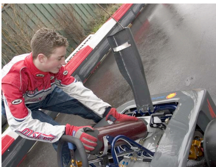
Using a 'click and go' high-pressure cartridge makes it easy and safe to refuel the kart.