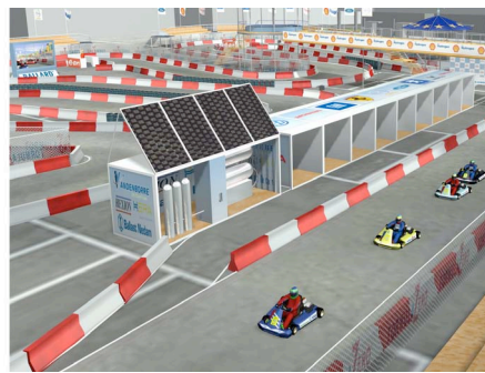
Next to the mobile track of the travelling circus, the hydrogen will be produced from solar, wind and biomass.

Formula Zero's zero emission racing is accredited by: