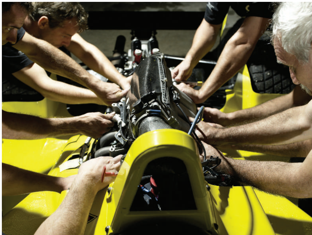
Many hands make light work: short design cycles put Formula 1 engineers under pressure to deliver.

But why stop with efficient energy recovery? Formula 1 could switch to using biofuels, maybe starting in 2011, says Mosley: "We would like to use a biofuel. The question is, which one. There are so many competing biofuel systems." What Formula 1 might end up doing is taking whatever fuel becomes adopted more widely, rather than picking a fuel in advance. Fuel cells relying on hydrogen are not yet being considered for Formula 1,