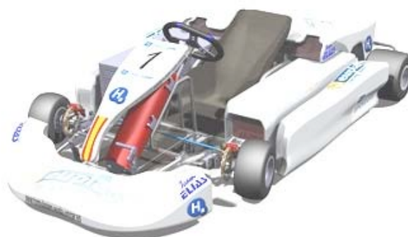
2. EuplatechH2 , Euplatech, Zaragoza, Spain