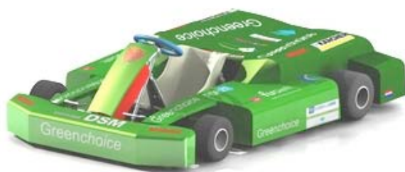
3. Greenchoice FORZE , University of Technology Delft The Netherlands